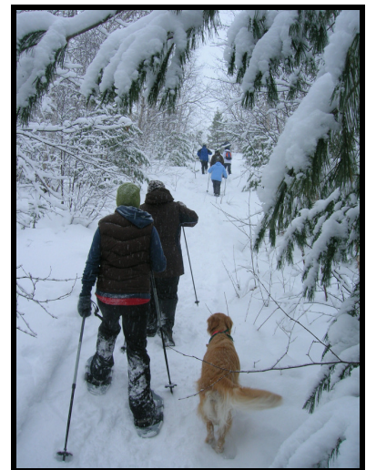
RRA Hike Club 2009: Lookout Trail

Our website is looking a little tired so we decided to give it a facelift too. Our address won't change but the look of it will. The new site will be much more user-friendly than the current site.